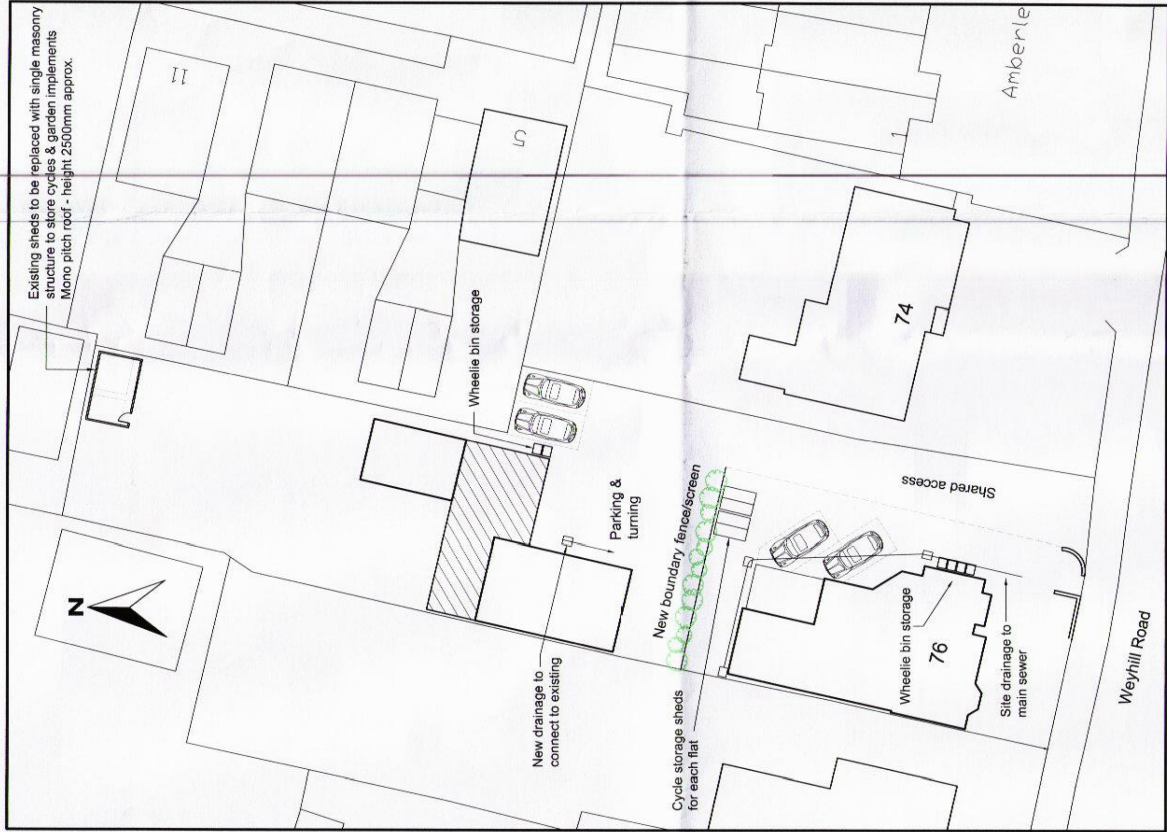
SITE LAYOUT PLAN Scale 1:250